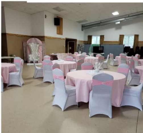
Sweet 16 Party