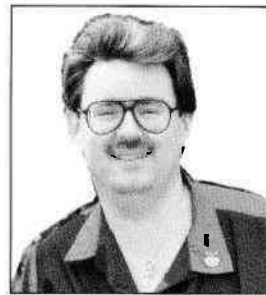
By Steve Brown

P REVIOUSLY we've looked at this one-shot strategy shooting at 101 through 120. Now we'll finish it out through 155. Once again these are last dart situations where the primary target is usually the triple 20, triple 19 or double bull. But by shooting strategically, we'll allow for a miss into any of those respective singles to still provide us with the maximum opportunity to finish on our next turn.