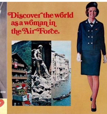
See Your Local Air Force Recruiter