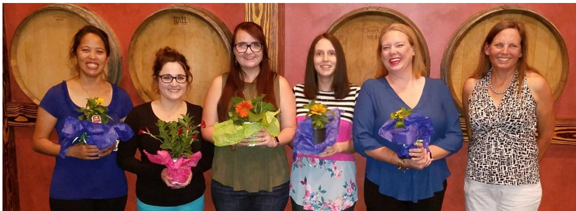
2018-2019 Executive Board (minus our Secretary)

Positions highlighted in yellow denote open positions