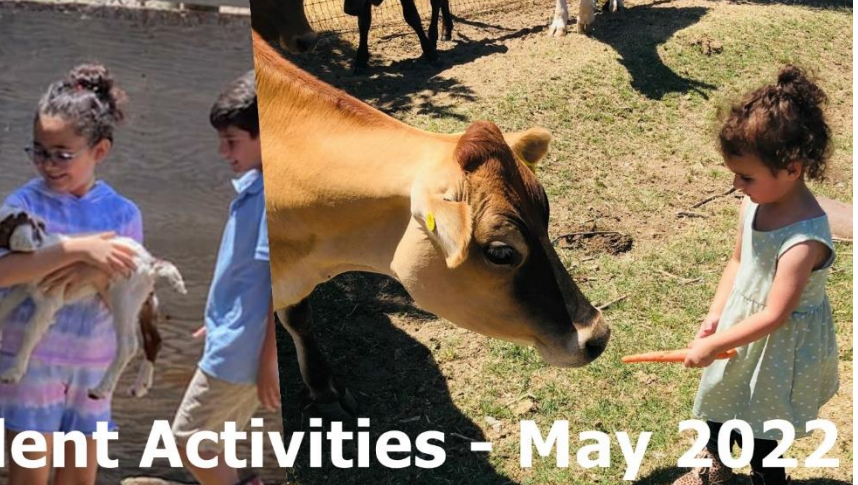
Sunday School Student Activities - May 2022