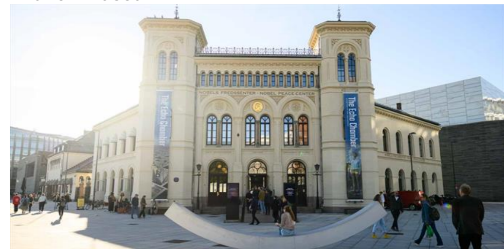
Nobel Peace Center