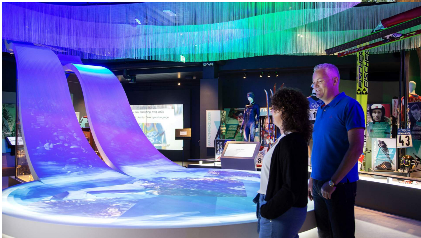
The Norwegian Olympic Museum

The town has a cozy atmosphere with charming streets, cafes, and shops!