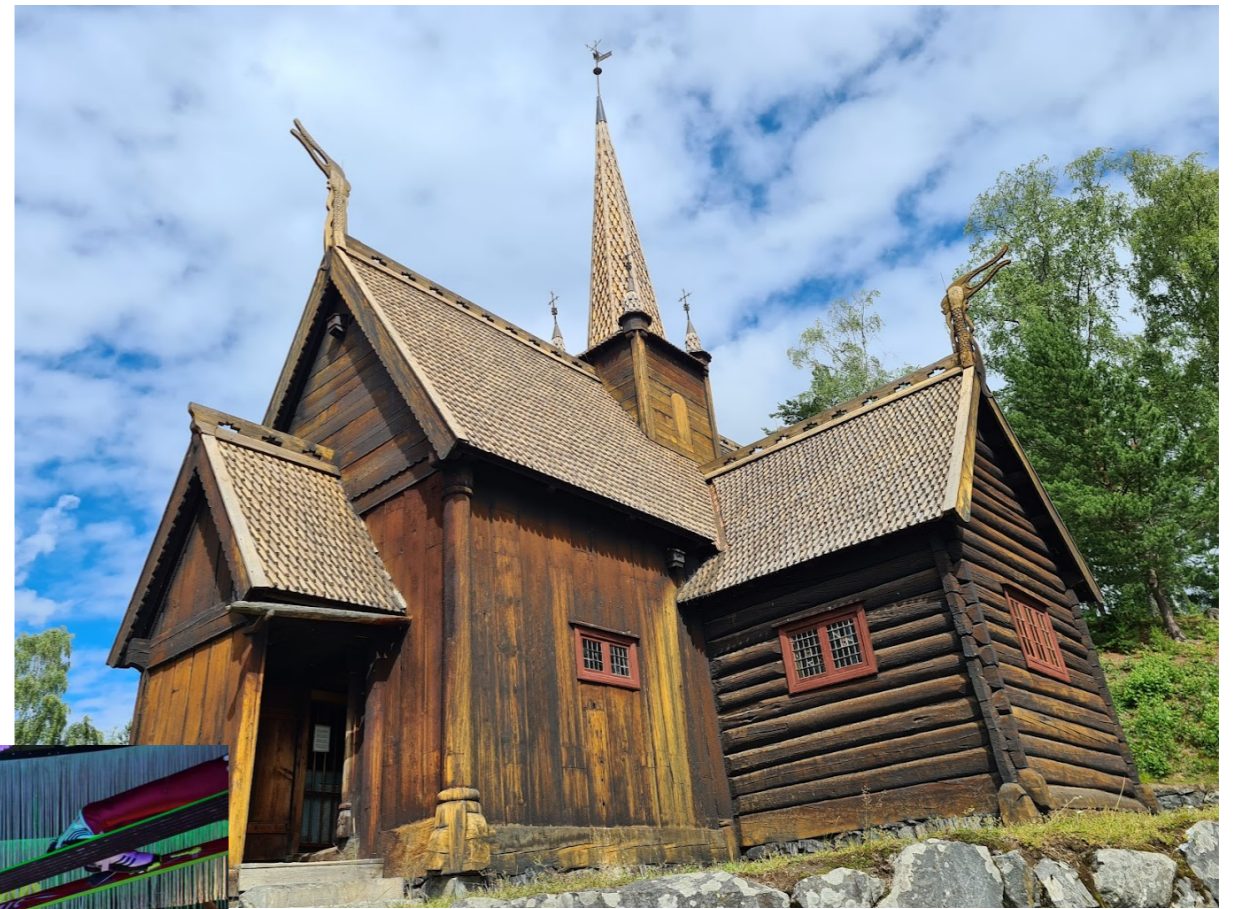
Maihaugen Open-Air Museum

Maihaugen Open-Air Museum The Norwegian Olympic Museum Lillehammer Art Museum