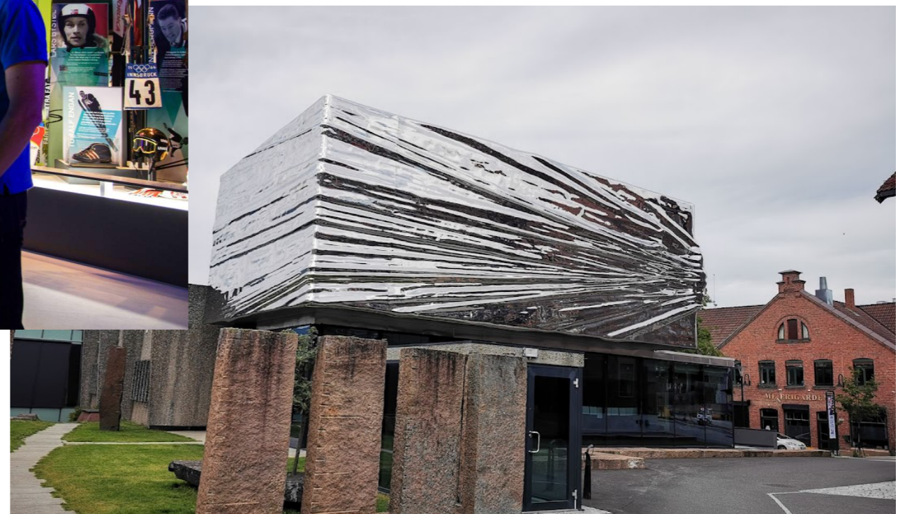
Lillehammer Art Museum

The town has a cozy atmosphere with charming streets, cafes, and shops!