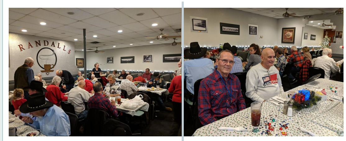
More Photo's on club web site: www.arizonaflywheelers.com