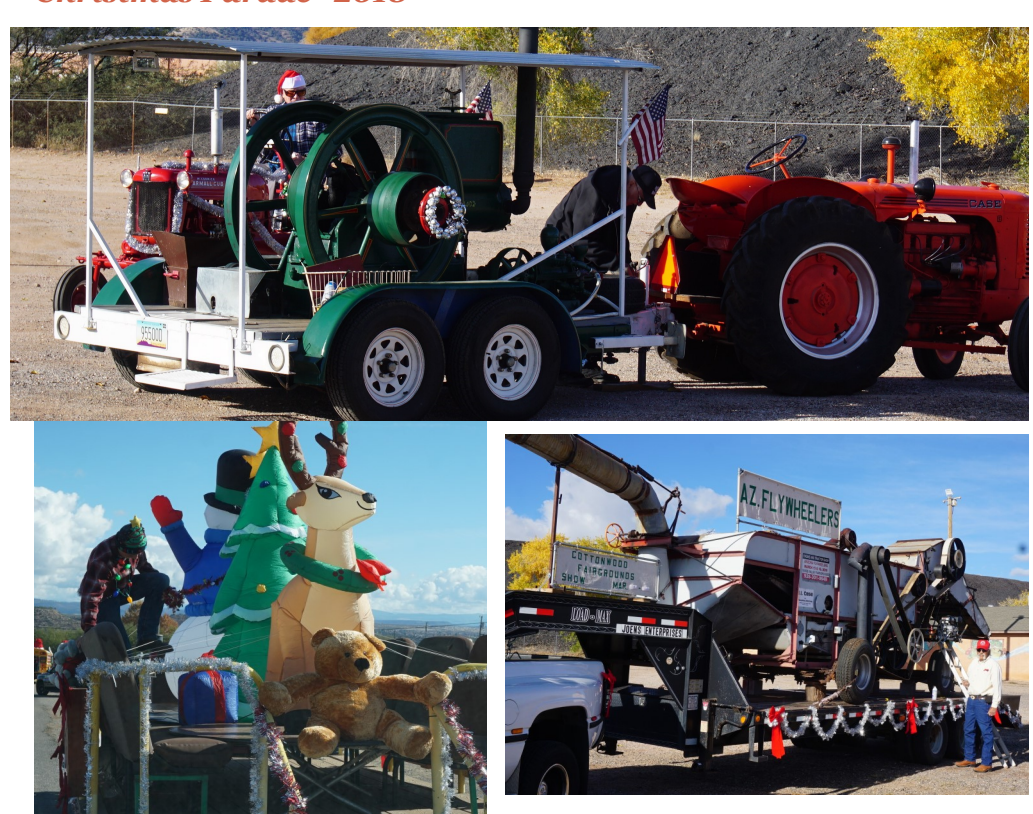
ANNUAL CHRISTMAS PARTY 2018