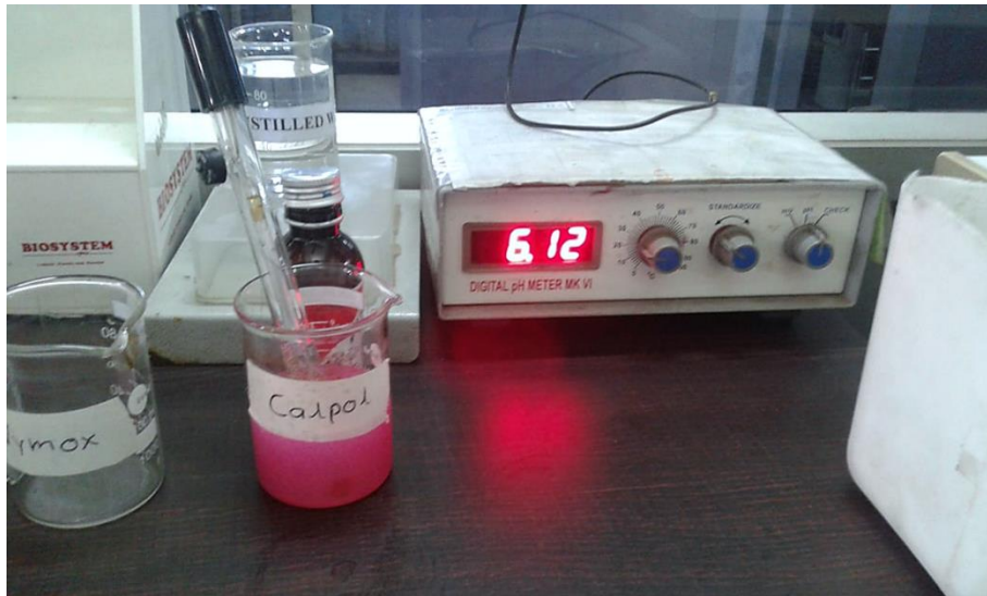
Fig 1: Estimation of pH of the liquid medications using digital pH meter.