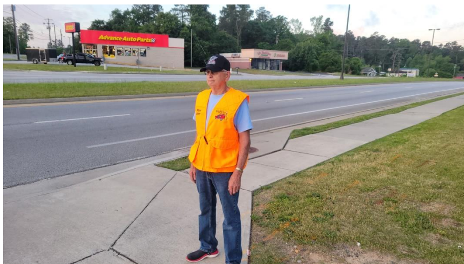
Our Parking Manager at Work