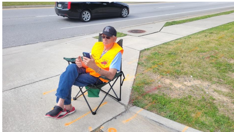
A tiring day for the parking manager