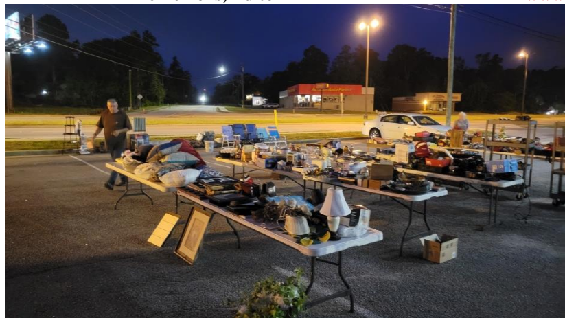
Setting up the parking lot for the yard sale