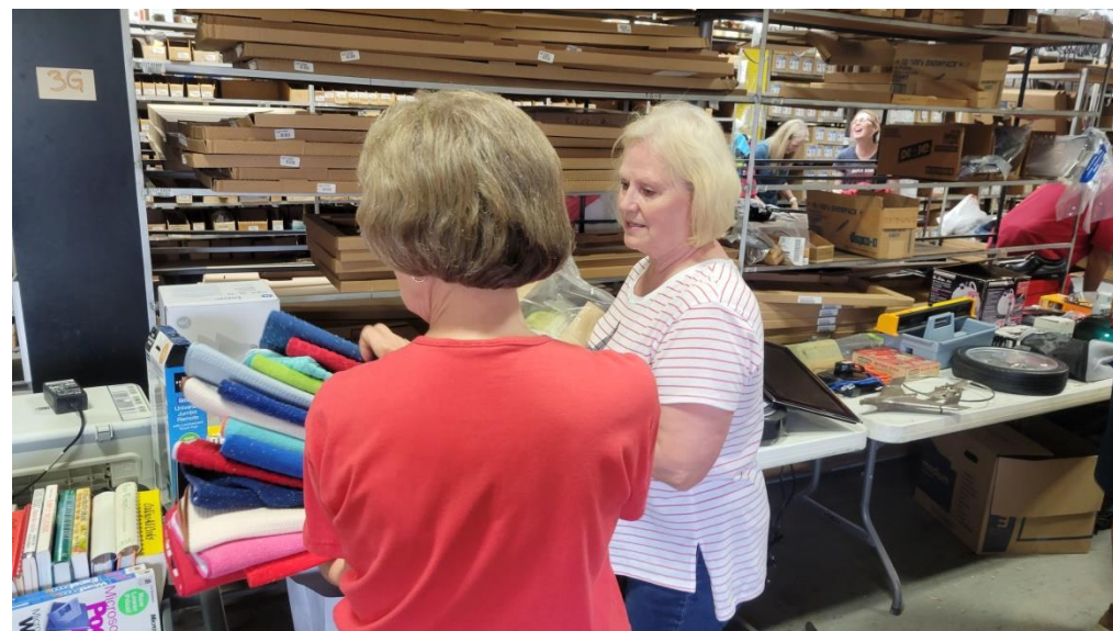
Yard Sale Sorting and Pricing