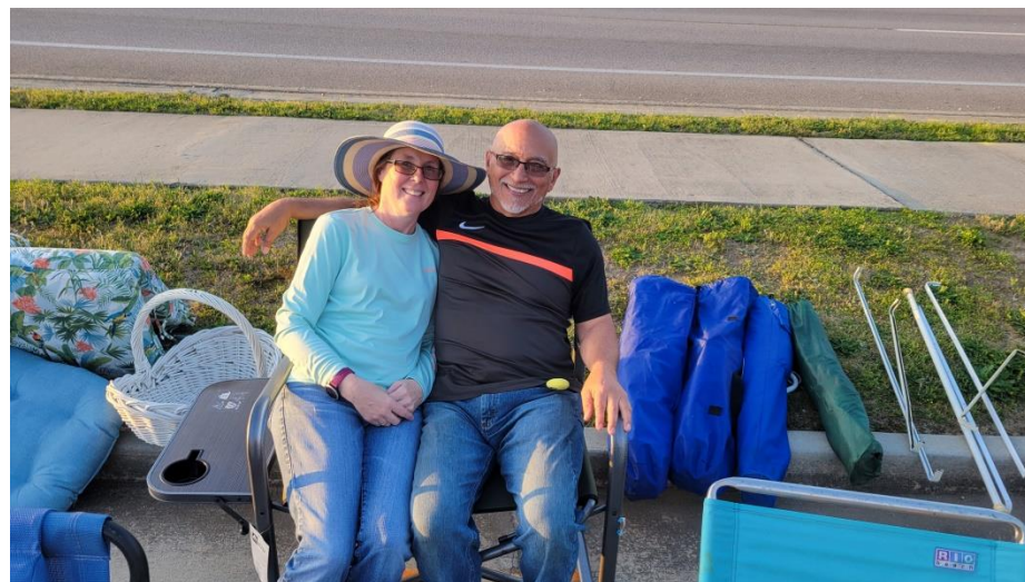
Taking a break