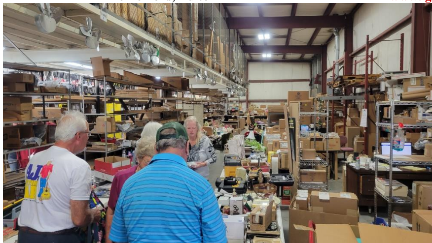
Yard Sale Sorting and Pricing