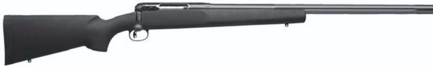
MODEL 12 LRP