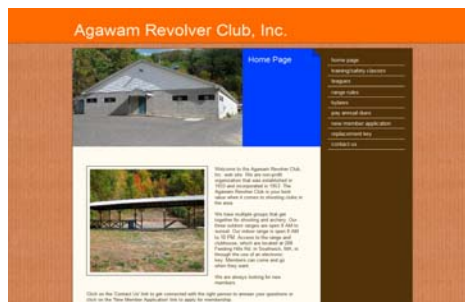
Newly expanded club web site.

Thanks to your efforts, we have expanded the number of email addresses on file to over 70% of our members. Members with email addresses on file have received timely notices regarding recent range closures and training opportunities at the club. We also plan to send renewal notices this year first via email, as we did last year, in order to limit postage costs. If you do have an email address, please consider sending it to us at: Secretary@AgawamRevolverClub.com . If you received this newsletter via USPS mail, we don't have your email address on file.