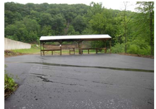
Newly expanded 100 yard range.

Since November 2010, our club web site at http://agawamrevolverclub.com has been expanded to include on-line renewal of yearly dues, scheduled events, posting of club bylaws, the ability to apply for membership and also to purchase a replacement key. Of course, contact information and directions to the club are there as well. Over 1/3 of our members renewed on the web this year (using a credit card or PayPal), saving money on postage and streamlining the renewal process for both members and the club.