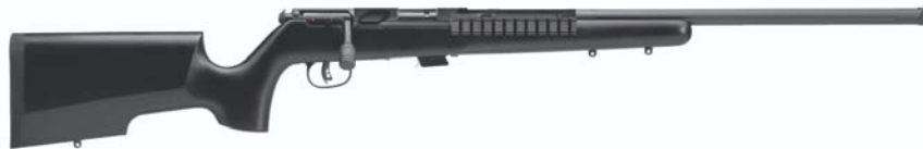
MODEL 93R17 TRR-SR