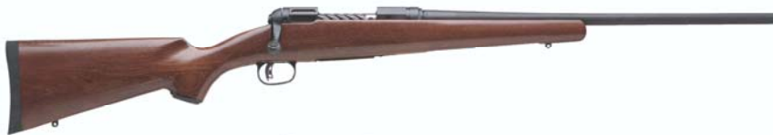
MODEL 11 LH