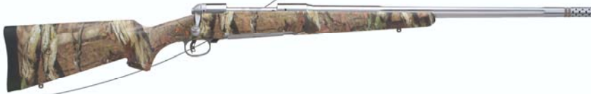
MODEL 16 BH