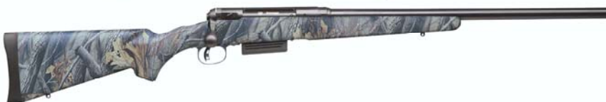
MODEL 220 CAMO