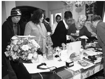
Members decide what items they want to bid on in the Silent Auction, before the live auction begins.