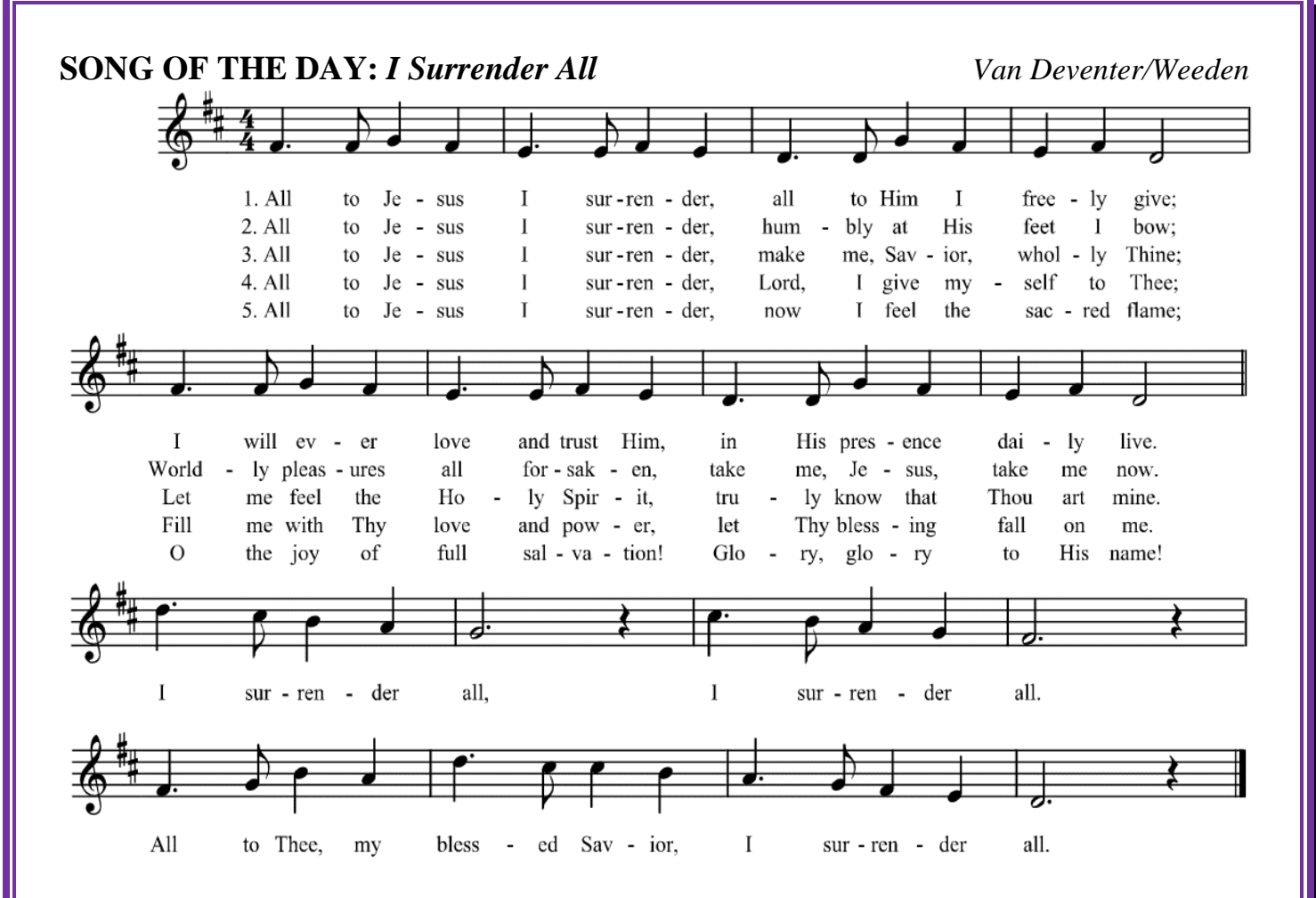
CCLI Song # 23189 © Words: Public Domain | Music: Public Domain For use solely with the SongSelect® Terms of Use. All rights reserved. www.ccli.com CCLI License # 3124891