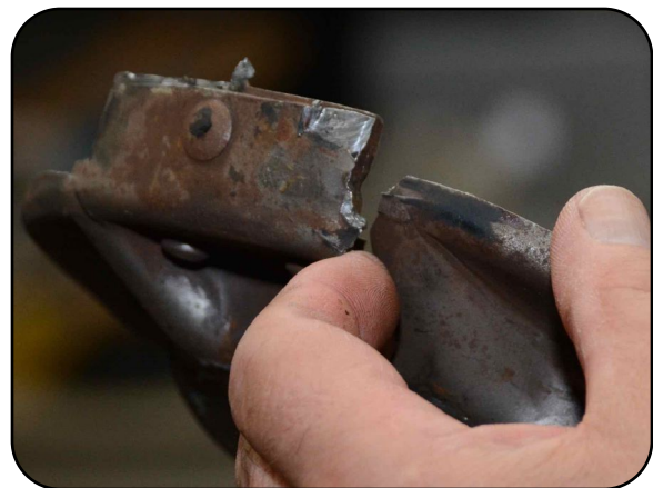
This is a serious piece of steel that was broken