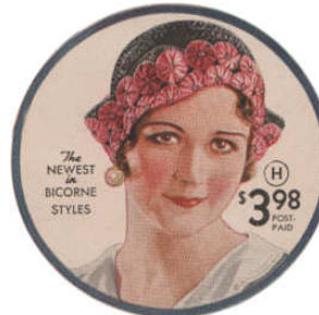
National Bellas Hess Co Inc Spring and Summer 1931 Applied plush flowers