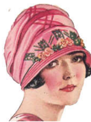
Sears, Roebuck and Co Spring and Summer 1928 Handmade fabric flowers