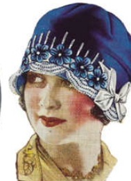
The Robert Simpson Co Fall and Winter 1928-29 Plush blossoms with tinsel stitching

Below are some "New-Old-Stock" (NOS) flower trimmings from an era Millinery supply.