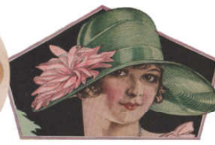
Sears Roebuck and Co Fall and Winter 1928-29 Organdy and rayon taffeta

Catalogs such as Sears and Montgomery Wards sold separate flowers and floral collections that could be used freshen up old hats or add to new hats and garments. It seems odd that most of time these catalogs showed them in black and white, but just a few color ads are to be found to help demonstrate the vivid colors that were available.