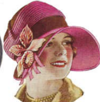
The Robert Simpson Catalog Fall and Winter 1928-29 Velvet orchid