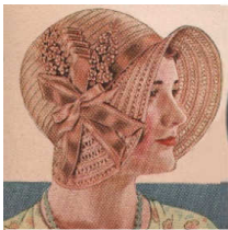
National Bellas Hess Co Spring and Summer 1931 plush flowers

Read the full article on the MAFCA Website at http://www.mafca.com/ef_articles.html and learn how hats and flowers complimented each other during the Model A years!