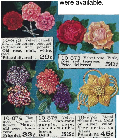
Robert Simpson catalog Fall and Winter 1928-

Catalogs such as Sears and Montgomery Wards sold separate flowers and floral collections that could be used freshen up old hats or add to new hats and garments. It seems odd that most of time these catalogs showed them in black and white, but just a few color ads are to be found to help demonstrate the vivid colors that were available.