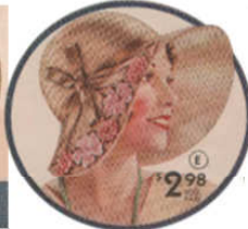
National Bellas Hess Co Spring and Summer 1931 Velvet flowers