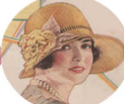
Sears Roebuck and Co Fall and Winter 1928-29 sheer organdy and rayon plush