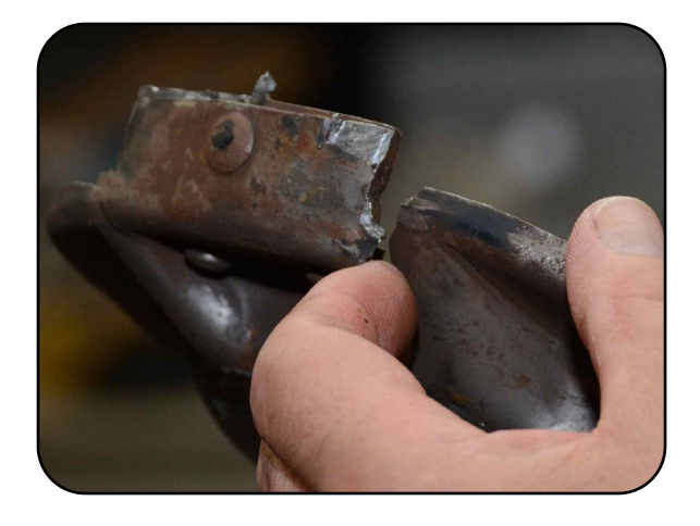
This is a serious piece of steel that was broken