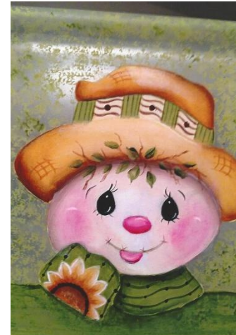
4 hours - Rosann Wagner "Cute Scarecrow"