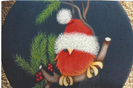
4 hours - Elizabeth Frum "Watching for Santa"

Level: Beginner Medium: Watercolor Size/Surface: 5" X 7" watercolor paper. Mat included. Supplies: Large Flat Brush, #6 round Cost: $19.00