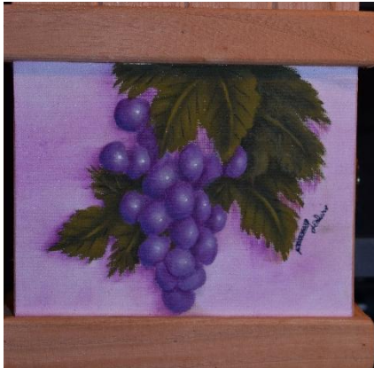
4 hours - Rosemary Habers "Purple Grapes"