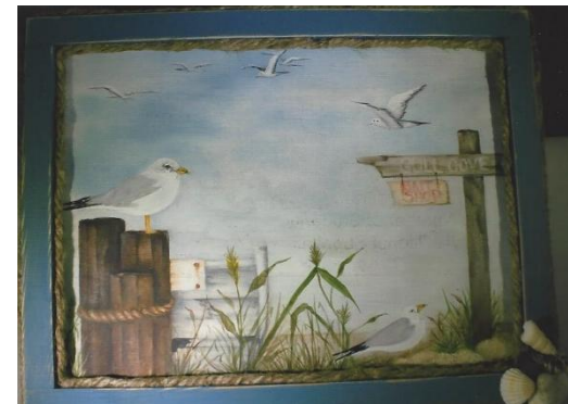
6 hours - Viki Sherman "Angel Gull Cove"