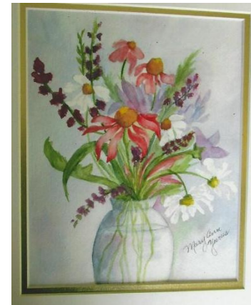
6 hours - MaryAnn Yurus "Vase of Flowers"