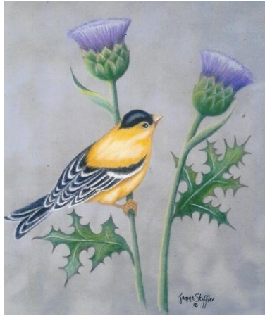
4 hours - Janine Stiffler "Thistle While You Work"

Level: Beginner Medium: Colored Pencil Size/Surface: 8" X 10" Suede Board Supplies: Pencil sharpener, white transfer paper