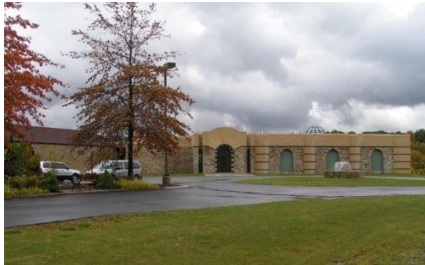
Fountain at Antiochian Museum