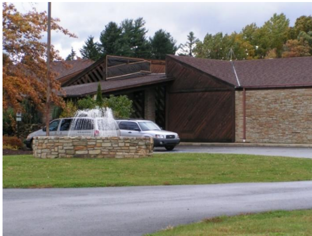
Front desk (check in here)