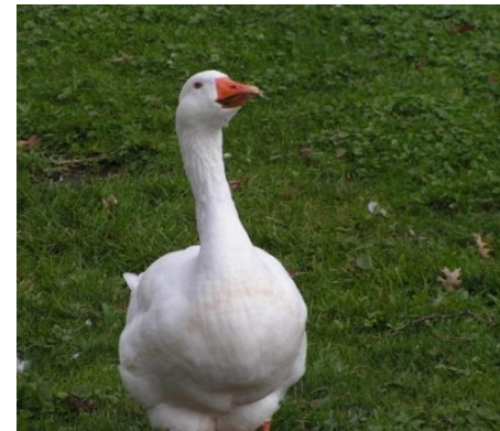
"Paint me....Paint me."

Level: Intermediate/Advanced Medium: Acrylic Size/Surface: 13 " X 8" wood tray Supplies: Normal painting supplies Cost: $18.00