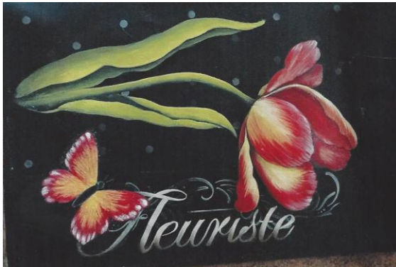
6 hours - Laura Angelo "Red Tulip"