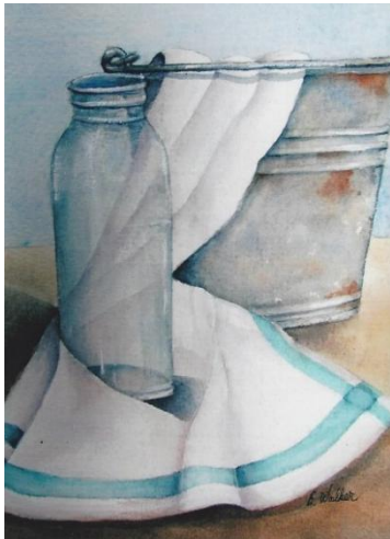
6 hours - Elaine Walker "Milk Pail and Bottle"

9:00am. – 12:00pm. and 1:00pm. – 4:00pm.