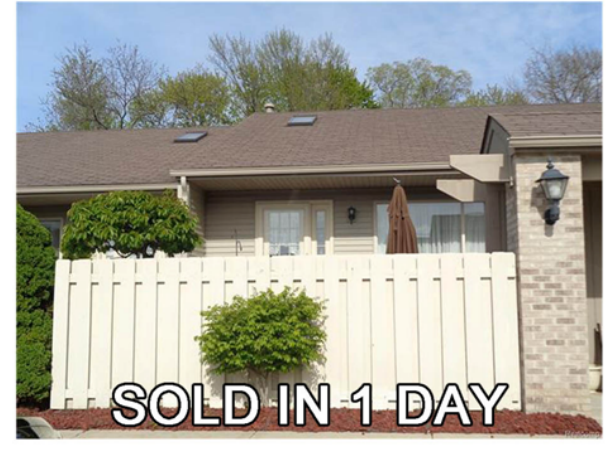
25162 JEFFERSON CT. Unit 3, $97,500 OFFER IN ONE DAY, GATED COURTYARD, 2 BEDROOMS, 2 FULL BATHS, OPEN FLOOR PLAN, CENTRAL AIR, FINISHED LOWER LEVEL, MOVE RIGHT IN.

Your Home-Town Realtor!!! specializing in SOUTH LYON, BRIGHTON AND NOVI.