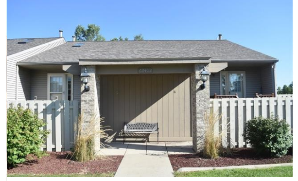
62402 Raleigh Ct. #5 $95,000 Very well cared for Original Owner 55+ Community Condo is a gem. Kitchen is open to Living Room and Dining Room with Cathedral Ceilings. Large master Suite with a Doorwall to quiet and serene Patio. Finished Lower Level with Fireplace, Full Bath