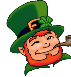
Out Like a Lamb