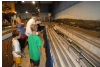
Control instructions by Ron