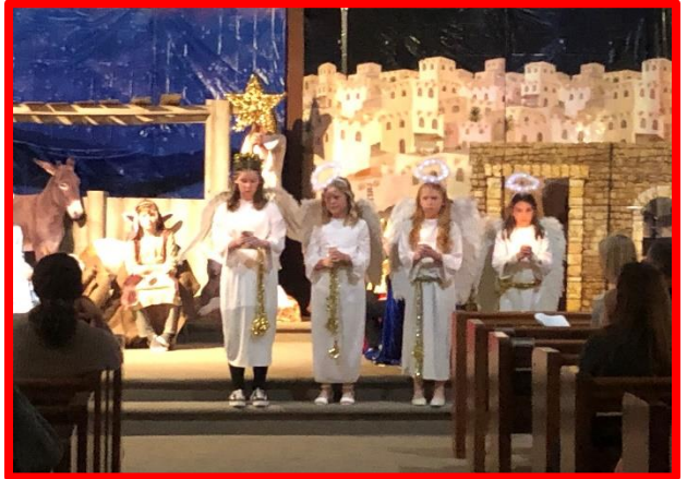
"The First Christmas"