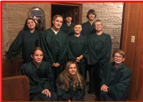
Confirmation kids ready for "Silent Night"