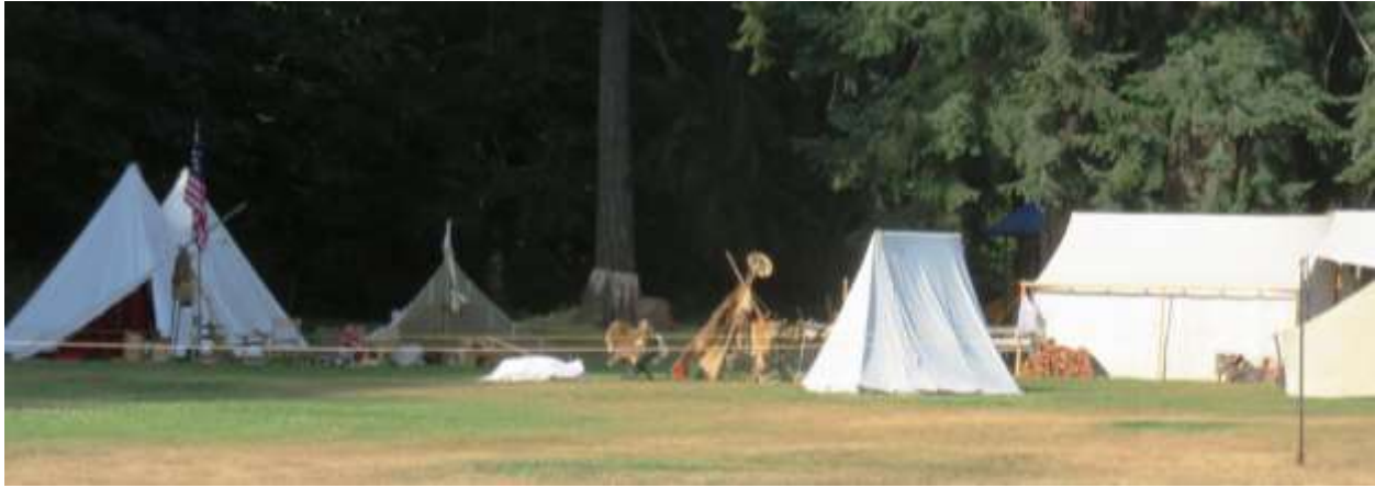
Primitive Camps at Tenino