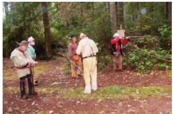
The crew hits the trail

On August 3rd, 4th, and 5 th in the year 1818, mountain men (and their women and young'uns) from far and wide showed up to the Bremerton Brigade Rendezvous. At night you could see near as well as day from the fires roaring at over 55