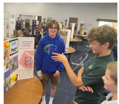
The Science Fair