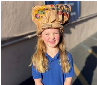
Above: Spirit Week