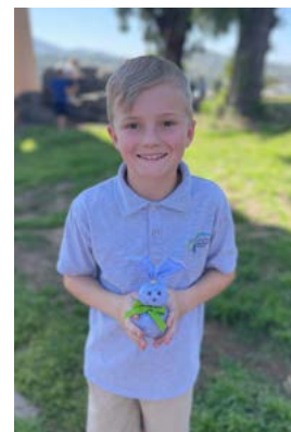
TCS Easter Egg Hunt