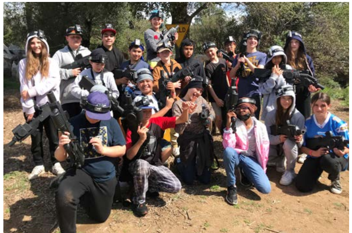
The six-graders attended Pine Valley Bible Camp.