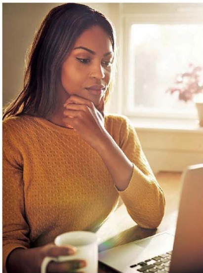
ILLUSTRATION BY JACQUES LUTHER

From Dear Padre: Questions Catholics Ask, © 2003 Liguori Publications