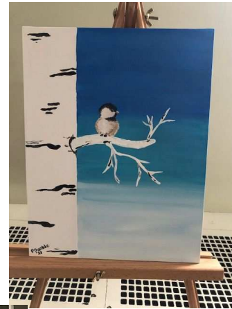
Painting class with Patty