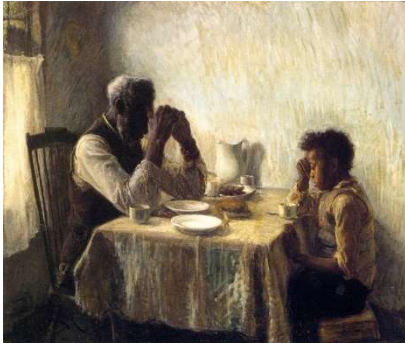
Thankful by Henry Ossawa Tanner