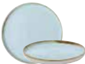
Chefs' Walled Plate SDESWP261 26cm 10¼" H: 2cm CTN QTY 6