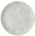
Coupe Plate ● KTAMEV111 28.8cm 11¼" CTN QTY 12