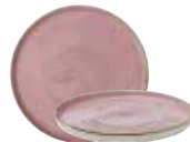
Chefs' Walled Plate SPPSWP261 26cm 10¼" H: 2cm CTN QTY 6