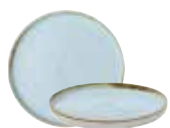
Chefs' Walled Plate SDESWP211 21cm 8¼" H: 2cm CTN QTY 6