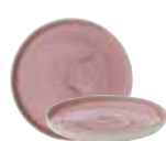
Chefs' Walled Plate SPPSWP211 21cm 8¼" H: 2cm CTN QTY 6