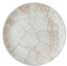
Coupe Plate ● KTAMEV101 26cm 10¼" CTN QTY 12