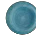
Coupe Plate ● SRBEEV111 28.8cm 11 1/4" CTN QTY 12