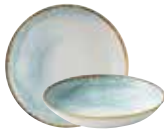
Coupe Bowl ● HAAMEVB91 24.8cm 9 7/8" 113.6cl 40oz CTN QTY 12