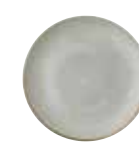
Coupe Plate ● SRGYEV101 26cm 10 1/4" CTN QTY 12