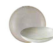
Coupe Bowl ● SRGYEVB91 24.8cm 9 3/4" 113.6cl 40oz CTN QTY 12