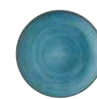
Coupe Plate ● SRBEEV101 26cm 10 1/4" CTN QTY 12