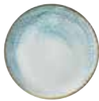
Coupe Plate ● HAAMEV111 28.8cm 11 1/4" CTN QTY 12