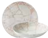
Coupe Bowl ● KTAMEVB91 24.8cm 9¾" 113.6cl 40oz CTN QTY 12