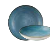
Coupe Bowl ● SRBEEVB91 24.8cm 9 3/4" 113.6cl 40oz CTN QTY 12