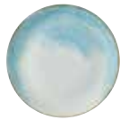
Coupe Plate ● HAAMEV101 26cm 10 1/4" CTN QTY 12