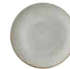
Coupe Plate ● SRGYEV111 28.8cm 11 1/4" CTN QTY 12