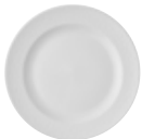
Plate ● APRDUP111 30cm 11½" CTN QTY 12

Service Plate ● APRDUS131 33cm 13" CTN QTY 6