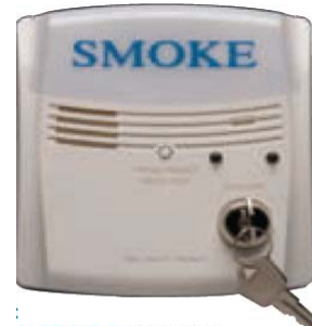
Figure 8 RTS2-AOS UL S2522