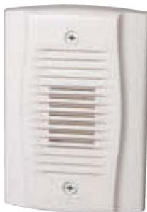
Figure 10 MHW UL S4011