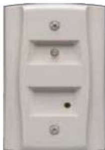
Figure 5 RTS151 UL S2522

System Sensor provides system flexibility with a variety of accessories, including two remote test stations and several different means of visible and audible system annunciation. As with our duct smoke detectors, all duct smoke detector accessories are UL listed.