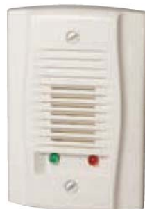
Figure 7 APA151 UL S4011