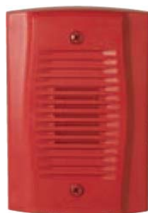
Figure 11 MHR UL S4011