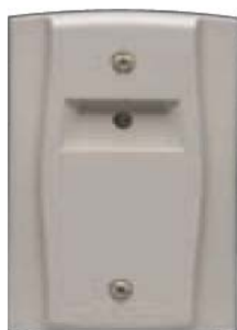
Figure 9 RA100Z UL S2522