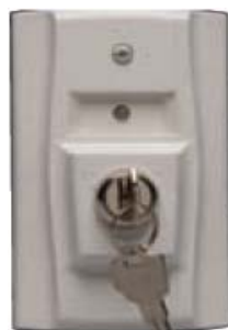
Figure 6 RTS151KEY UL S2522