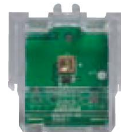
Figure 12 RTS2-AOS with PS24LOW Strobe and PS12/24 LENSW lens