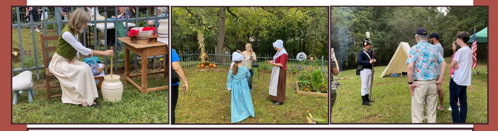
GARS and FDF members as reenactors performing frontier demonstrations