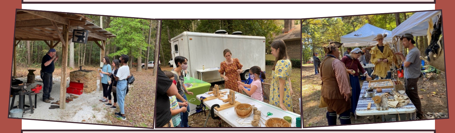
Exhibitors and reenactors telling the story of Fort Daniel, Gwinnett County, and Georgia