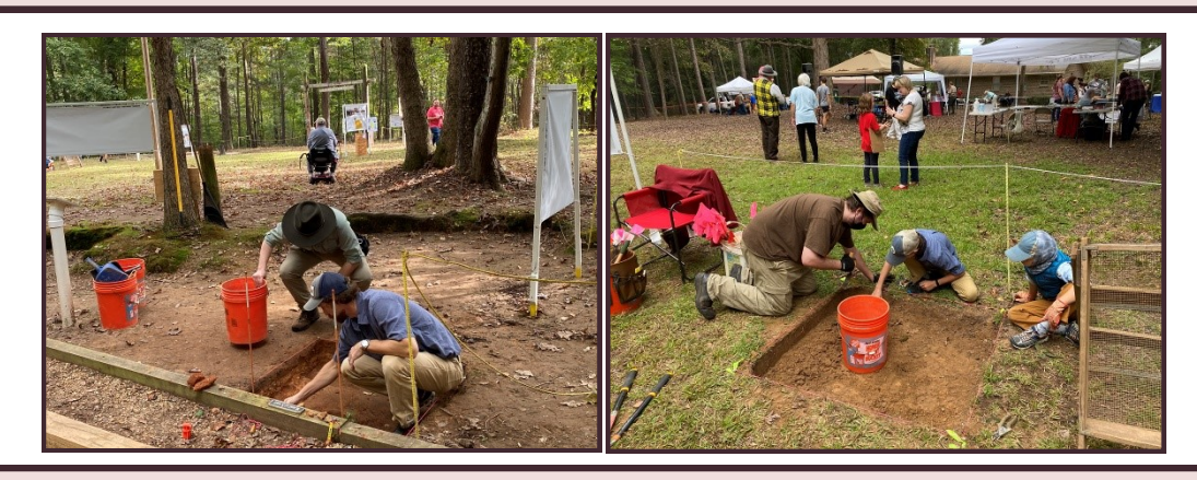
Public Archaeology at Fort Daniel