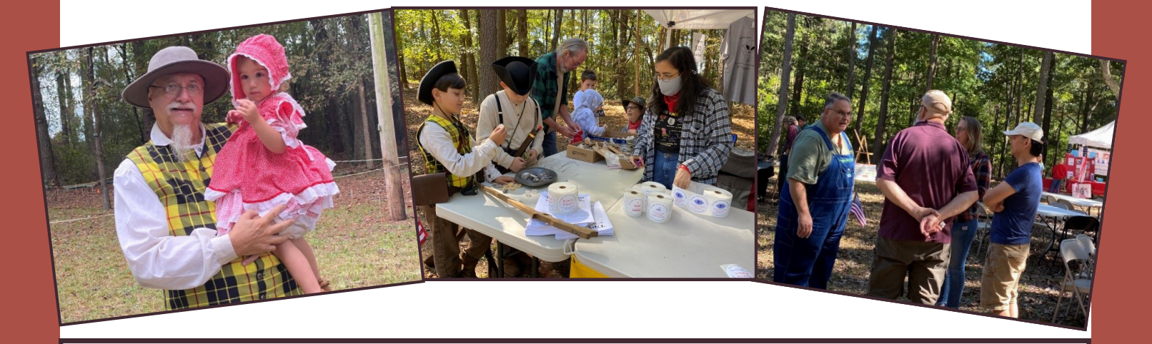
Visitors enjoying the beautiful weather