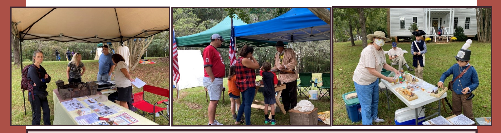
GARS and FDF members talking with visitors about the history of Fort Daniel