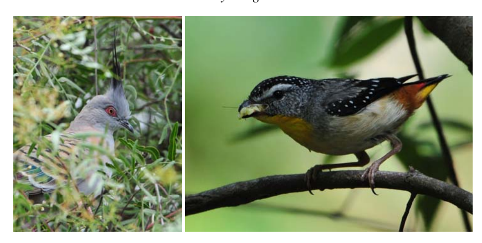
Crested Pigeon; Spotted Pardelote