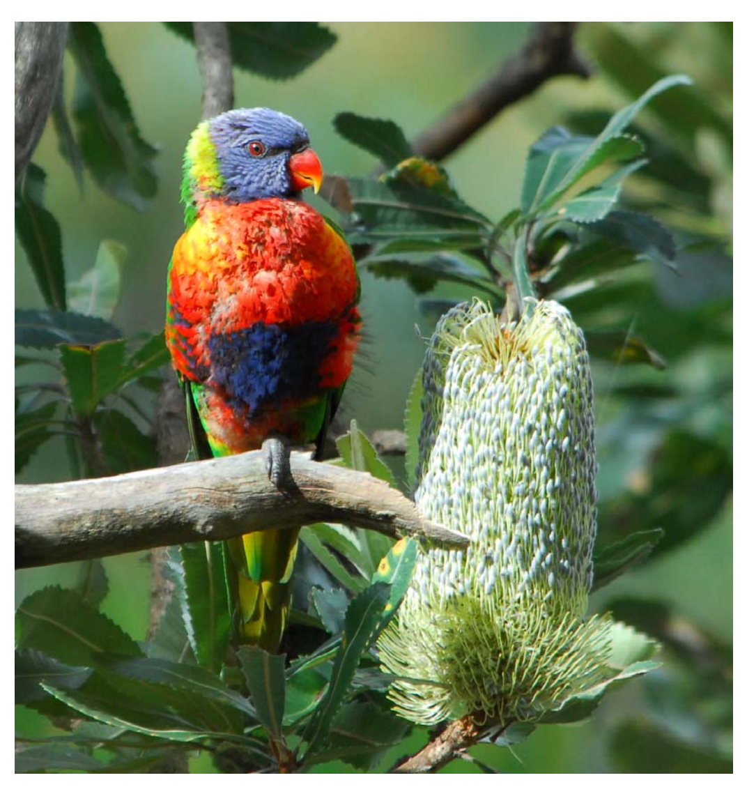
Rainbow Lorikeet and Banksia

This report briefly summarises sightings during our Sydney vacation in December 2007 and January 2008. We made no dedicated birding trips during the visit, however we saw many interesting species during our various activities - e.g. various water birds and parrots during rounds of golf at Long Reef and Pymble Golf Clubs; Little Penguins whilst sailing on Sydney Harbour and Pittwater; a wide variety of forest birds (including Superb Lyrebird) on morning walks in the Ku-ring-gai municipality bush reserve in suburban Sydney; and various scrub birds on a visit to a friend's property at Blaxland's Ridge to the northwest of the city. In addition we saw various parrots in suburban Melbourne gardens (e.g. Musk Lorikeet) during a brief visit to the city, and on a family property at Yass near Canberra saw several other species (e.g. Superb Parrot).