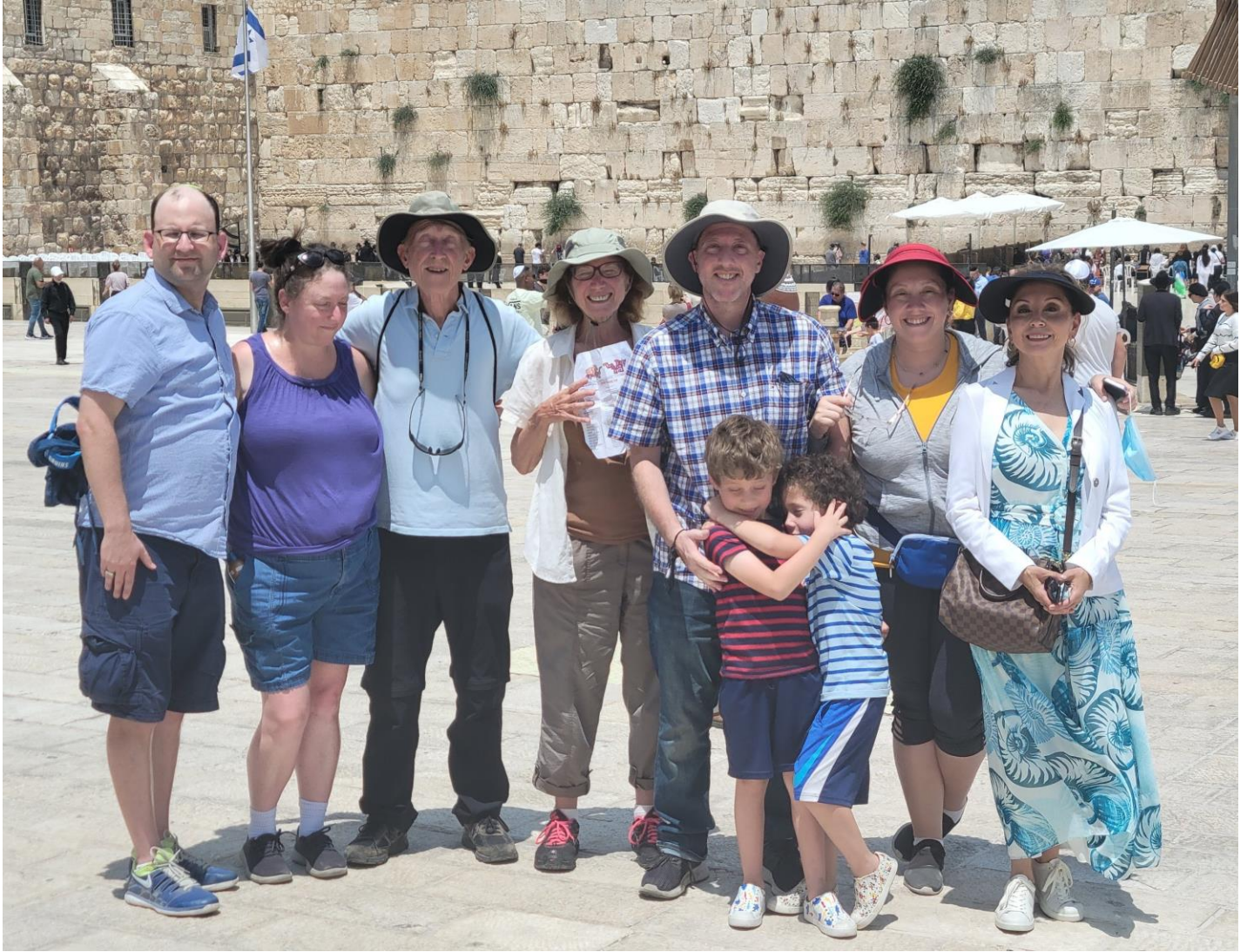
Three generations of the Lewises Family at the Western Wall