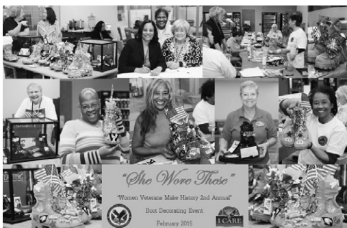
Collage of women Veterans decorating their boots.

Her tireless energy, devotion and commitment to our veterans are a testament to her dedication and exemplify MWAN goals, and is deserving of the award. Keep your fingers crossed for her selection. The winner will be announced at the Annual VA National Advisory Committee Conference in May.