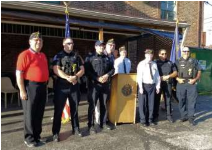
Along with our members, officers and our local Knights of Columbus, we were honored to have our local Farmington Public Safety officers as participants and guests at this year's Flag Day - Flag Retirement Ceremony in June.