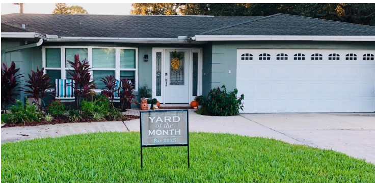
October Yard of the Month on Tanglewood Dr

LARGE-ITEM PICKUP DAY: Many neighbors took advantage of this FREE service on Monday, Nov 19. It's a benefit of our negotiated contract with Waste Connections.