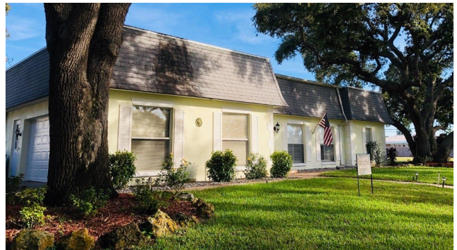
November Yard of the Month on Oakglenn Dr

We have several neighbors dealing with serious illness. They don't care to be mentioned by name, but please keep them in your kind thoughts & prayers.