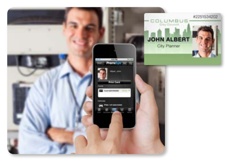
PremiSys Mobile App turns your smartphone into a mobile enrollment station.