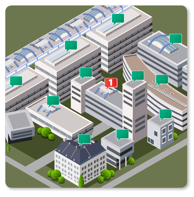
Dynamic Mapping makes it easy to pinpoint the exact location of a door in alarm.

Whether you need access control for a small office building or to provide a complex network of facilities with world-class card access security management, PremiSys<sup>™</sup> is your total access control solution.