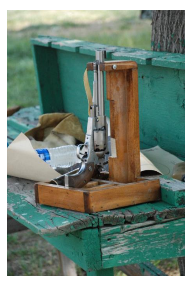
Pistol a la Millhouse