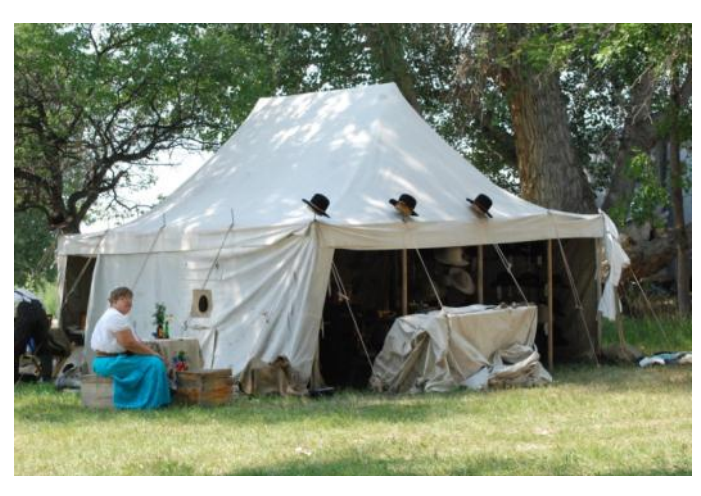
Little Grizzly Trading Tent "Hat Maker"