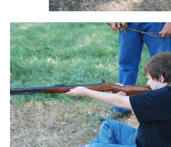
Trying to determine the dominate eye.