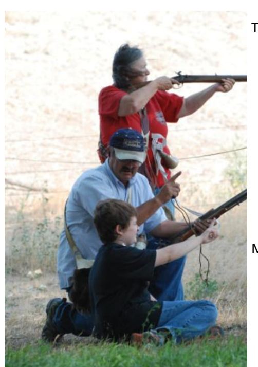
Mom come look, I hit the target!