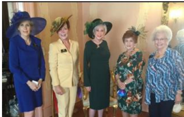
Woman's Club Presidents at the October Luncheon