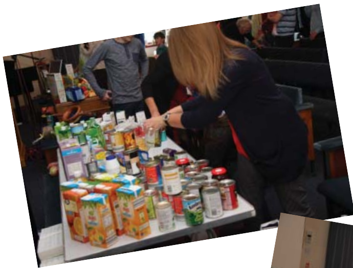
Lots of food to be gifted to the North Ayrshire Food Bank