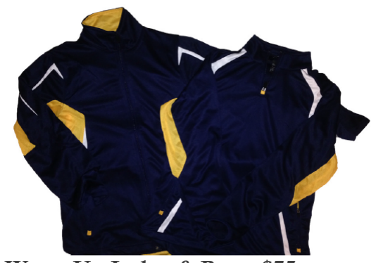
Warm Up Jacket & Pants $75 Embroidered/personalized 1/4 zip or full zip jacket and pants

Yellow corex material with Royal Die Cut lettering (same image as car decal)