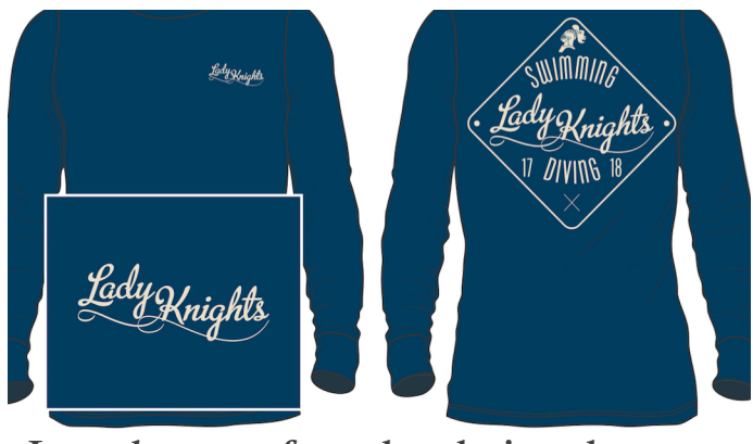
Long sleeve comfort colors denim color garment with vintage print cream $18.00 S-XL