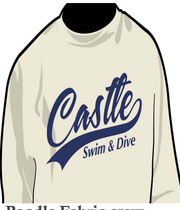
Poodle Fabric crew sweatshirt $30.00 S-XL