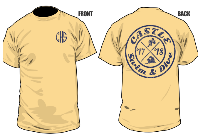
Butter yellow comfort colors short sleeve pocket t-shirt with distressed navy $14.00 S -XL