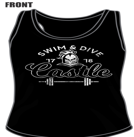
Black tank top $12.00 S-XL