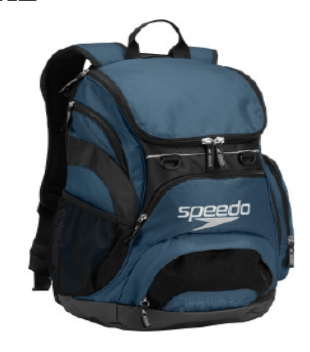
Speedo Team Bag $70.00 Embroidered with Castle & Last Name $60.00 Plain