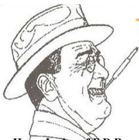
Home Lodge of F.D.R.