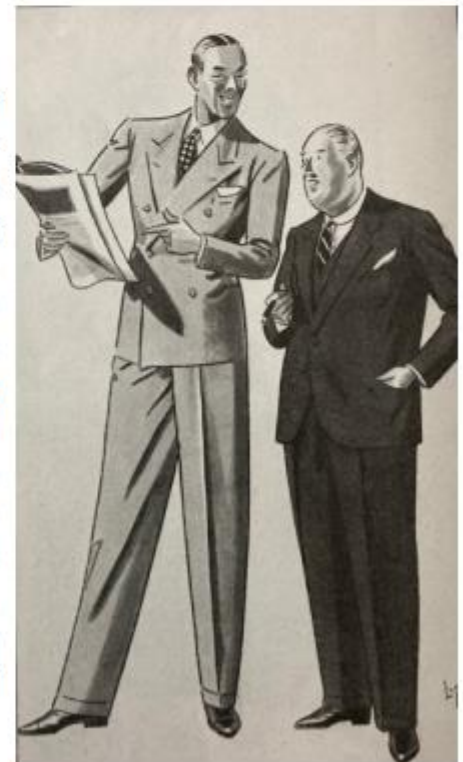
It's wise to choose a suit with the right lines for your figure.

What follows are suggestions from Wetzel's representative: