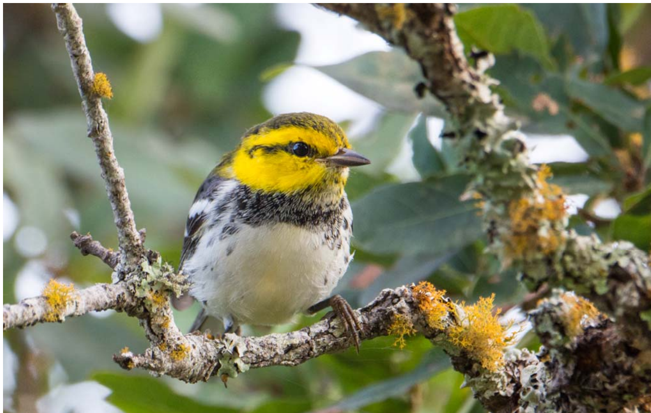
Golden-cheeked Warbler (immature) [Lost Maples State Natural Area]

Our afternoon and morning in the State Natural Area, along with a 'heat of the day' visit to the bird blinds at Pedernales Falls State Park, resulted in a personal trip list of 41 bird species (see the annotated list in this report). In addition to one lifer (Bell's Vireo), I was delighted to have secured my best ever views, and some photographs, of the two key species.