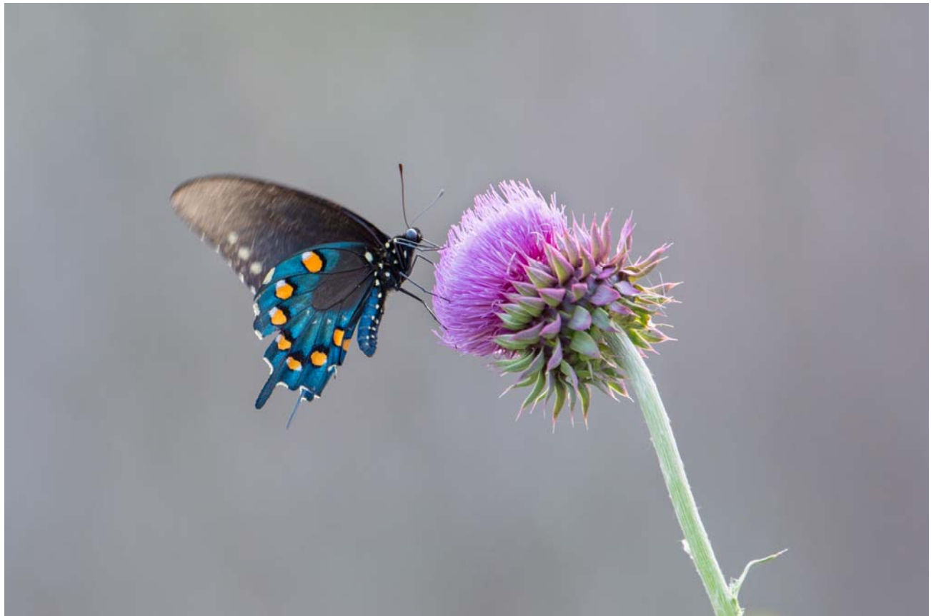
Pipevine Swallowtail (Battus philenor) [Lost Maples State Natural Area]