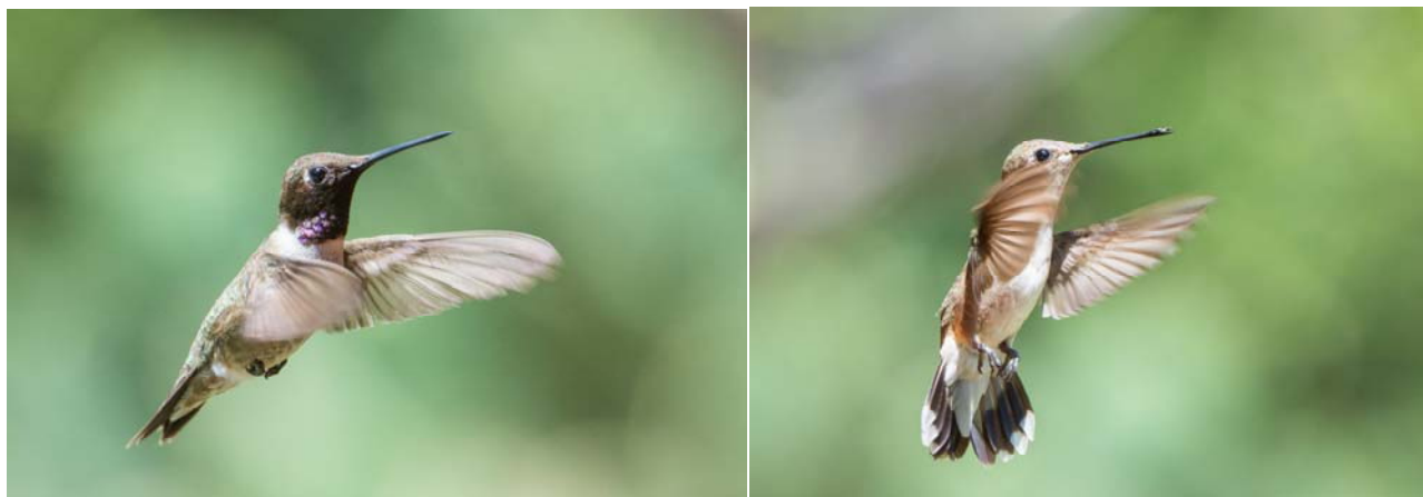
Black-chinned Hummingbird (male & female) [Pedernales Falls State Park]

Fortunately the fly-in, fly-out trip also delivered a solid list of lifers for David M-K (some 29 lifer species, moving him within tantalising reach of the 3,000 life-list milestone!). With the charismatic Greater Roadrunner having eluded us on this occasion, there remains good reason for a return visit!