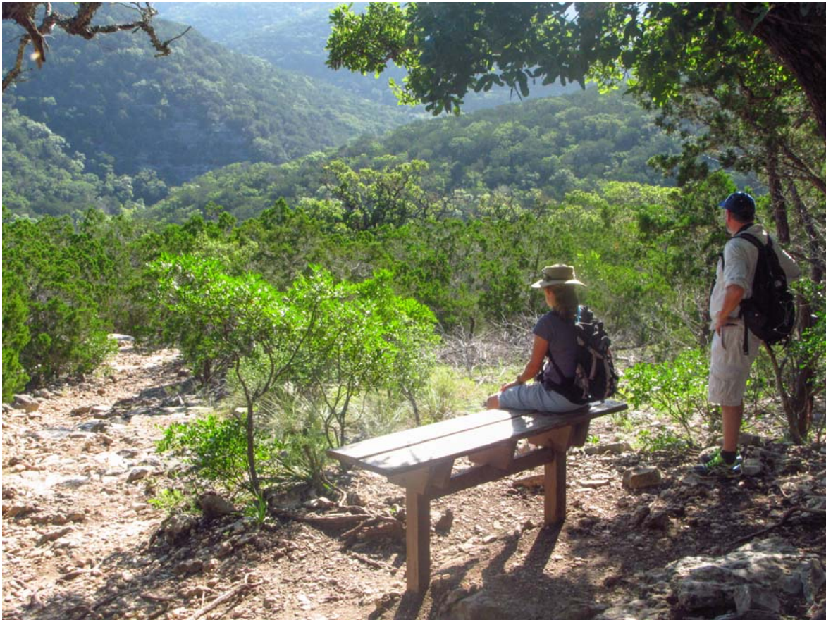
View descending from the ridge at Lost Maples State Natural Area after seeing the targeted warblers and vireos