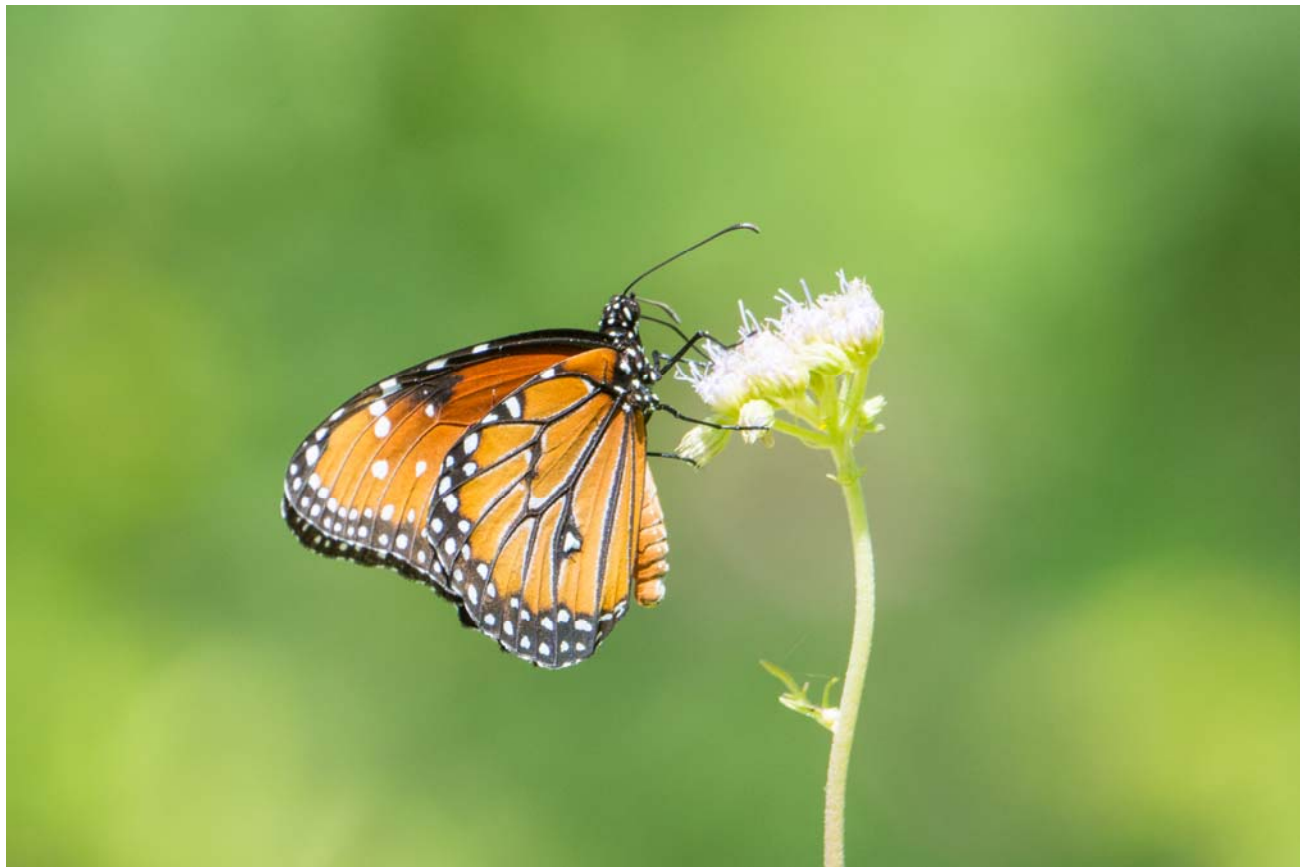
Queen Butterfly (Danaus gilippus) [Pedernales Falls State Park]