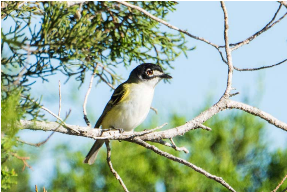
Black-Capped Vireo [Lost Maples State Natural Area]