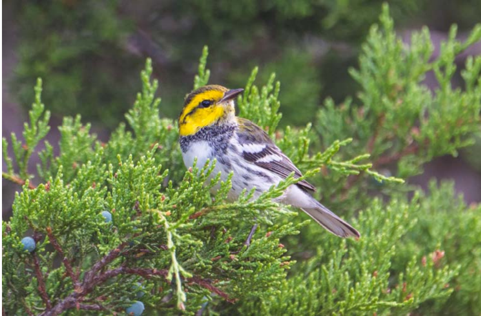
Golden-cheeked Warbler (immature) [Lost Maples State Natural Area]

David M-K joined us for a birding blitz in search of two iconic and endangered spring/summer specialties that breed only in threatened habitats in the Hill Country west of Austin and San Antonio - namely the delightful Golden-cheeked Warbler and Black-capped Vireo. Each species has unique habitat requirements, with the Golden-cheeked Warbler making their nests exclusively out of bark stripped from mature ashe juniper ( Juniperus ashei ) trees and the Black-capped Vireo requiring low growing woody cover for nesting (with nests typically built 2-4 feet above the ground in shrubs such as shin oak ( Quercus havardii ) or sumac Anacardiaceae sp.). We successfully located both species during a morning of bush walking along the ridges at Lost Maples State Natural Area, before the temperature rose towards its summer peak of around 100°F.