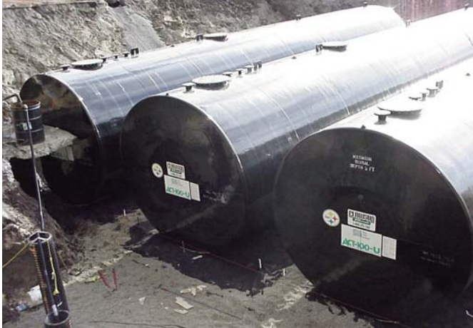
Single or double-wall construction available

ACT-100-U ® tank features a strong inner steel tank for structural integrity, and a thick urethane outer coating for long-lasting corrosion protection. The ACT-100-U ® provides a barrier from corrosion comparable to a fiberglass reinforced plastic coated (composite) steel tank.