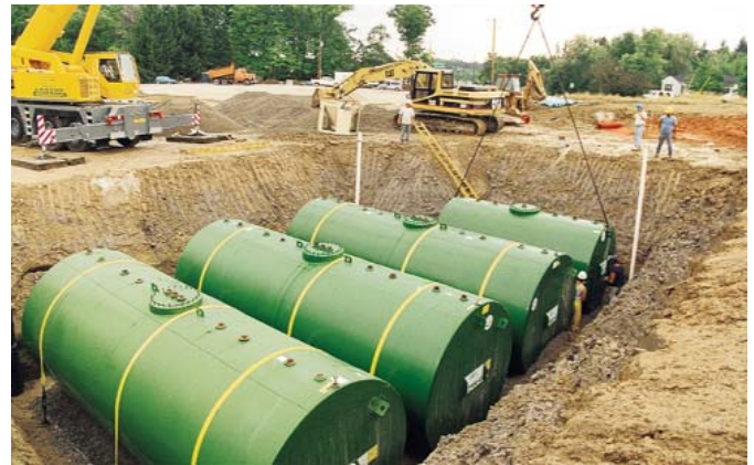
Compatible with a wide range of fuels and chemicals, including biodiesel and ethanol

PROTECT THE ENVIRONMENT. BUY RECYCLABLE STEEL TANKS.