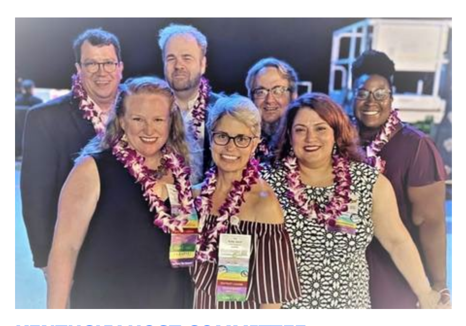
KENTUCKY HOST COMMITTEE