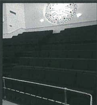
New Seating in Balcony