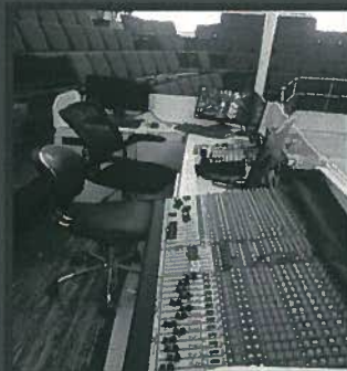
New Sound Booth