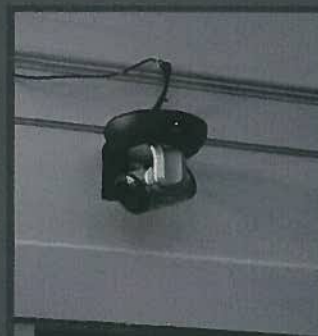
New Digital Camera System