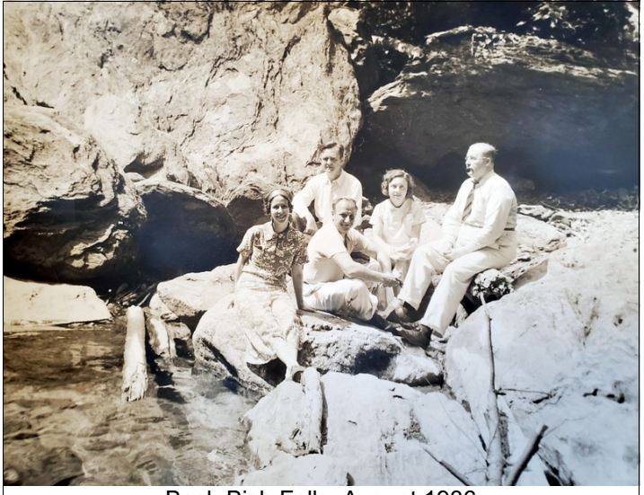
Bash Bish Falls, August 1936

<u>Week-End March 25-26 - Taconic Park</u> <u>Reservation and Bash Bish Falls</u>. Trip to Copake Falls leaving Saturday afternoon. Arrive Taconic Park, stay overnight in cabins, hike Sunday morning and return Sunday afternoon. A stop may be made if desired at Drover's Inn, Dover Plains for dinner. Dinner $1.50, very good.