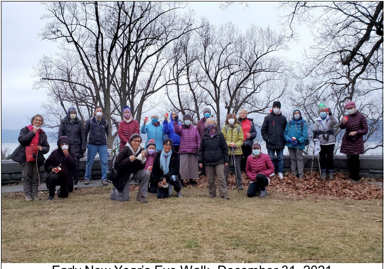
Early New Year's Eve Walk, December 31, 2021

Week in Harpers Ferry and the Delaware Water Gap had a robust attendance of 35.