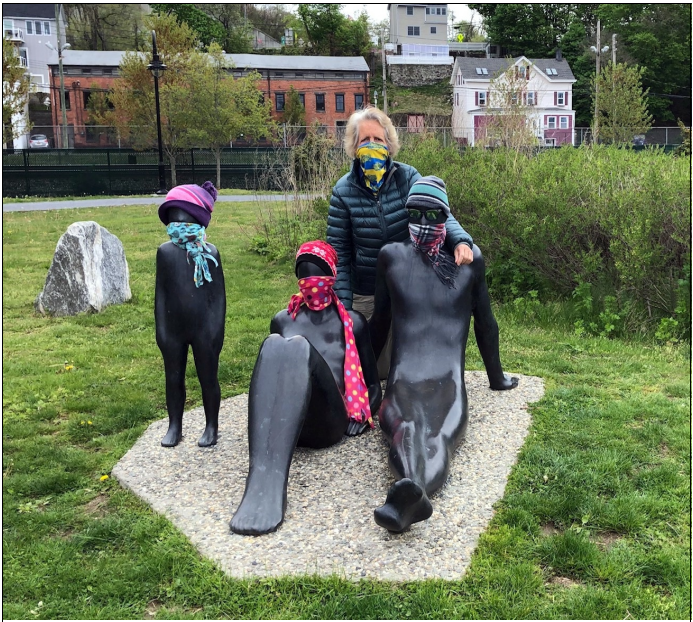
Although there could have been more social distancing during this visit to Peekskill Landing Park in May, 2020, at least everyone was wearing a mask.

but we soon realized that outings could be resumed on a modified basis if we kept the groups small, eliminated carpools, and took other precautions. To allow for changing conditions we sent emails to members with hike listings instead of printing a formal schedule. And because of the disruptions in 2020 the club waived membership renewal dues for the following year. People were told not to send us their money, but to use the $12 to buy something for themselves instead.