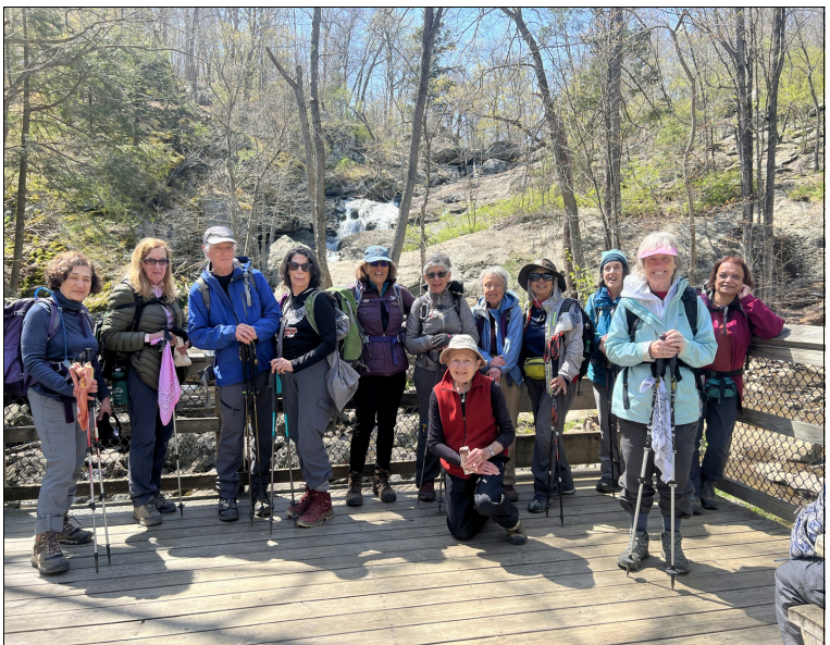
Relaxing near the end of the trail at Maryland's Cunningham Falls State Park during our 2022 Hiking Week.