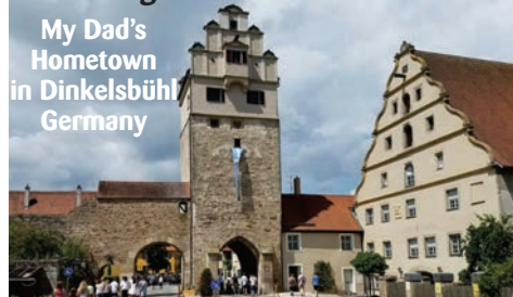
My Dad's Hometown in Dinkelsbühl, Germany

Our Original Recipes from Europe brought to America in 1947