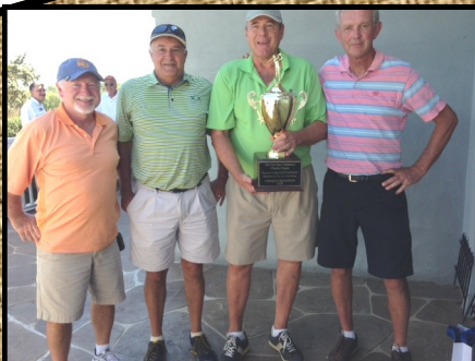
Trinity Methodist Church—2015 Church Winners

Bonus this year! Each player will receive a FREE ROUND OF GOLF For a future date at the Links!