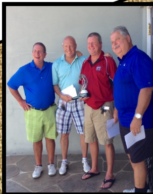
Ingles—2015 Corporate Winner