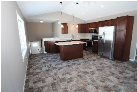
*SOME OPTIONS MAY BE SHOWN*