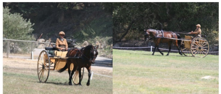
Meadowbrook with 16.2 hand horse

52 inch wheels , Shafts are 7 feet in length , shafts are 35 inches wide