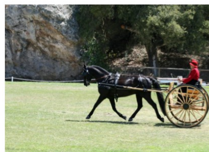
Meadowbrook with 15 hand horse