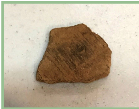
Pottery sherds similar to this one found at Fort Daniel were also found at the possible Native site in Huntsville, Alabama.