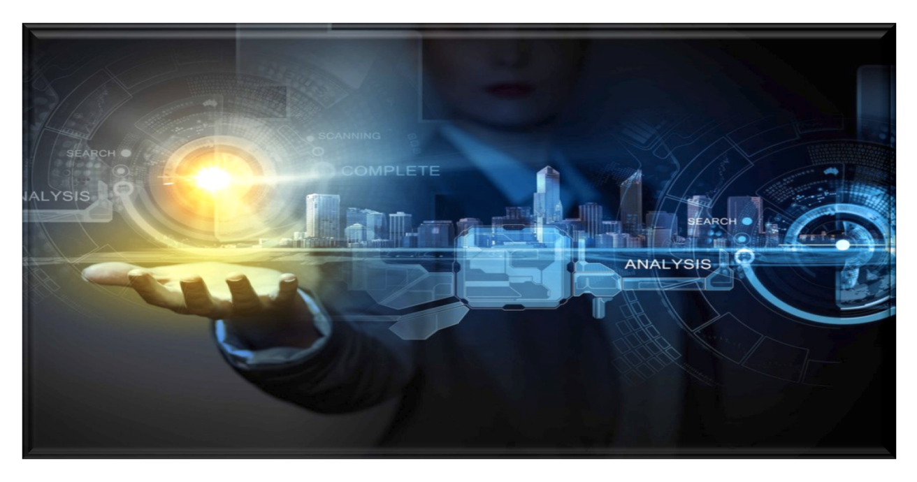
"Making the movies that almost everyone wants to see."

The Most Lucrative Investment Scenario You Will Ever Encounter